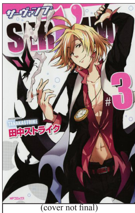
(cover not final)