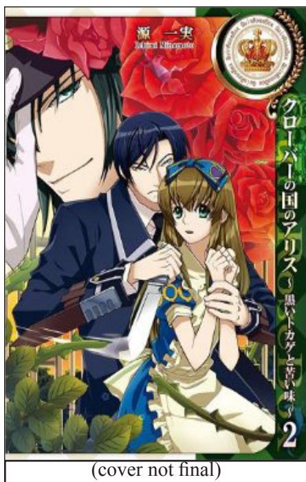
(cover not final)