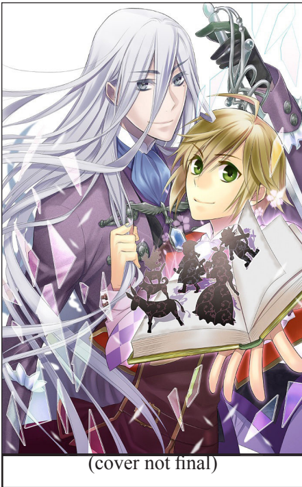
(cover not final)